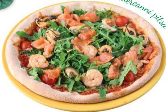
Rikkalik mereanni pitsa